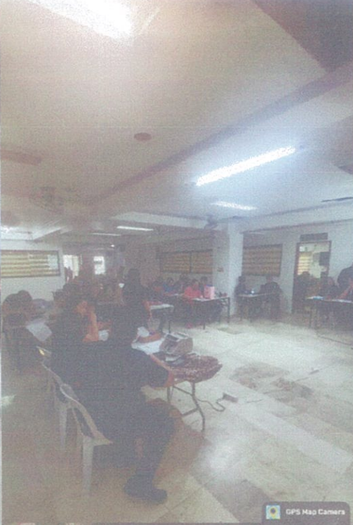
Manila, Metro Manila, Philippines MICT South Access Road, Tondo, Manila, Metro Manila 1010, Philippines Lat 14.597354, Long 120.955528 02/20/2025 10:33 AM GMT+08:00 Note : Captured by GPS Map Camera