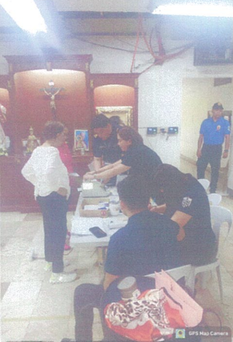
Manila, Metro Manila, Philippines MICT South Access Road, Tondo, Manila, Metro Manila 1010, Philippines Lat 14.597745, Long 120.955718 02/20/2025 11:09 AM GMT+08:00