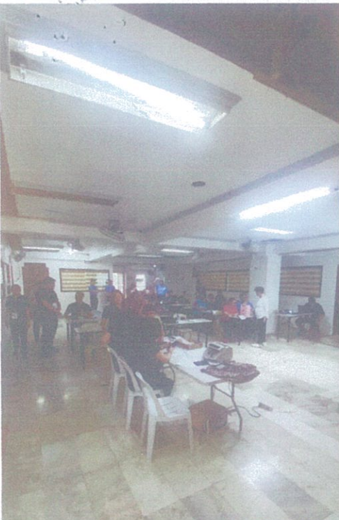
Manila, Metro Manila, Philippines MICT South Access Road, Tondo, Manila, Metro Manila 1010, Philippines Lat 14.596801, Long 120.955396 02/20/2025 10:17 AM GMT+08:00 Note : Captured by GPS Map Camera