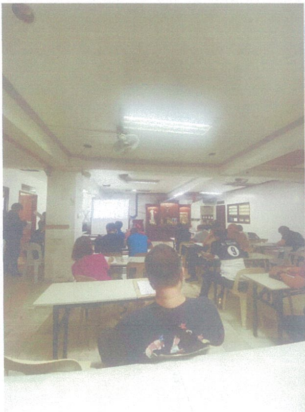
Manila, Metro Manila, Philippines MICT South Access Road, Tondo, Manila, Metro Manila 1010, Philippines Lat 14.597745, Long 120.955718 02/20/2025 11:09 AM GMT+08:00 Note : Captured by GPS Map Camera