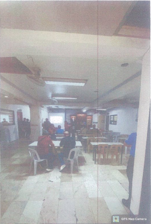
Manila, Metro Manila, Philippines MICT South Access Road, Tondo, Manila, Metro Manila 1010, Philippines Lat 14.597258, Long 120.955388 02/20/2025 09:33 AM GMT+08:00 Note : Captured by GPS Map Camera