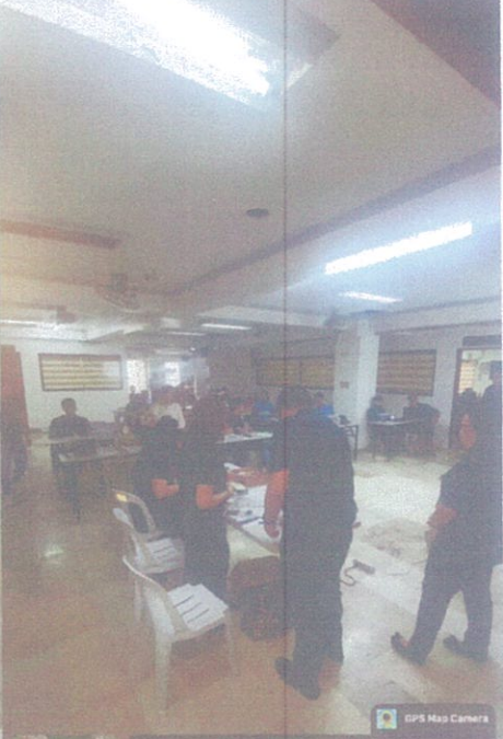
Manila, Metro Manila, Philippines MICT South Access Road, Tondo, Manila, Metro Manila 1010, Philippines Lat 14.597766, Long 120.955753 02/20/2025 11:09 AM GMT+08:00 Note : Captured by GPS Map Camera