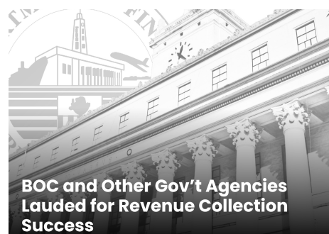
BOC and Other Gov't Agencies Lauded for Revenue Collection Success