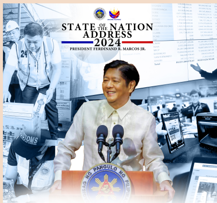
President Marcos Highlights Customs' Landmark Successes in SONA 2024