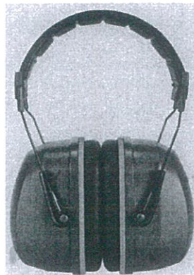
PS46 Ear Muff

PS46 Ear Muff, on the other hand, is also a hearing protection device comprising of two cushioned ear cups integrated to a padded headband. It is equipped with an adjustable dual pin system for a precise fit on the ears. Subject ear muff is constructed from a combination of materials, including acrylonitrile butadiene styrene (ABS), polyurethane (PU) foam, and polyvinyl chloride (PVC). The ear muff is intended to be worn directly over the head to provide protection for the ear.