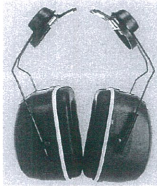
PS45 Ear Muff

PS46 Ear Muff, on the other hand, is also a hearing protection device comprising of two cushioned ear cups integrated to a padded headband. It is equipped with an adjustable dual pin system for a precise fit on the ears. Subject ear muff is constructed from a combination of materials, including acrylonitrile butadiene styrene (ABS), polyurethane (PU) foam, and polyvinyl chloride (PVC). The ear muff is intended to be worn directly over the head to provide protection for the ear.