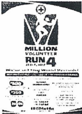
MVR4 Poster.jpg 298K