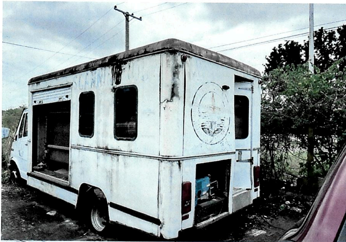
One (1) unit of Astrophysics Mobile Baggage X-ray Machine located at Clark, Pampanga